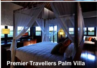
Premier Travellers Palm Villa