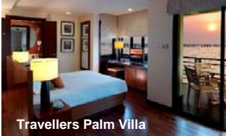
Travellers Palm Villa